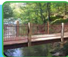
Trails & Bridges