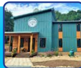
Wellness Center & Spa